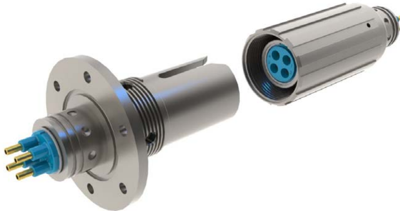
Figure 4: An example of a Diver Mate Connector Pair