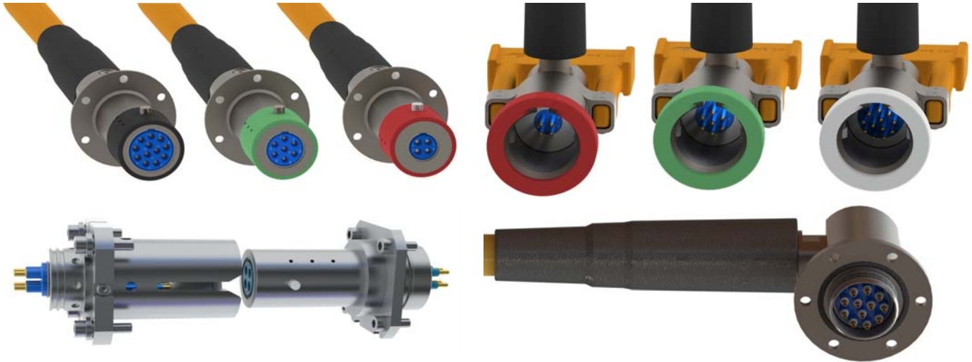
Figure 1: Examples of ROV, Stab Plate, and Penetrator Nautilus Configurations

This Installation and Operation Manual applies to all variants of the Nautilus plug and receptacle connectors, and the Nautilus penetrator connectors. Each connector's outline and interface details can be provided on a separate drawing.