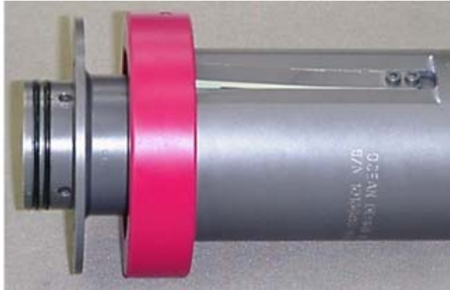
Figure 3: ROV Latch Fingers in the Open Position