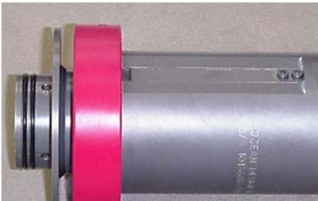
Figure 2: ROV Latch Fingers in the Closed Position

ROV connectors are equipped with latch fingers to verify proper engagement of the connector halves. The sides of the latch fingers have high visibility paint applied to either side to provide a visual indication of a successful mating. Refer to Figures 2 and 3 for image of the latch fingers.